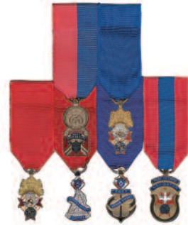
Diagram 6 Past State Deputy Former Vice Supreme Master Former District Master Former District Deputy Past Grand Knight Past Faithful Navigator