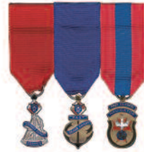
Diagram 3 Former District Deputy Past Grand Knight Past Faithful Navigator