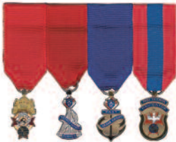
Diagram 4 Former District Master Former District Deputy Past Grand Knight Past Faithful Navigator