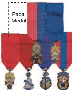
Diagram 7 Papal Medal Past State Deputy Former Vice Supreme Master Former District Master Former District Deputy Past Grand Knight Past Faithful Navigator