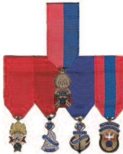
Diagram 5 Past State Deputy Former District Master Former District Deputy Past Grand Knight Past Faithful Navigator