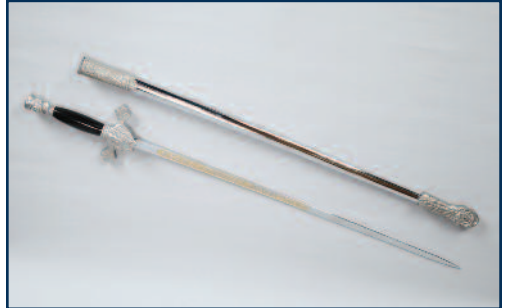
Black Handled Sword with Scabbard