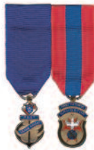
Diagram 2 Past Grand Knight Past Faithful Navigator